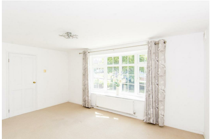
Lounge 15'7" x 10'6" (4.75m x 3.20m)

Double glazed bow window to front elevation. Feature coal effect living flame gas fire and surround. Television point. Radiator. Opening through to kitchen/breakfast room.