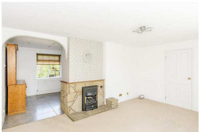
(Lounge Photo Two)

Double glazed bow window to front elevation. Feature coal effect living flame gas fire and surround. Television point. Radiator. Opening through to kitchen/breakfast room.