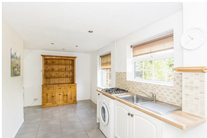
(Kitchen/Breakfast Room Photo Two)