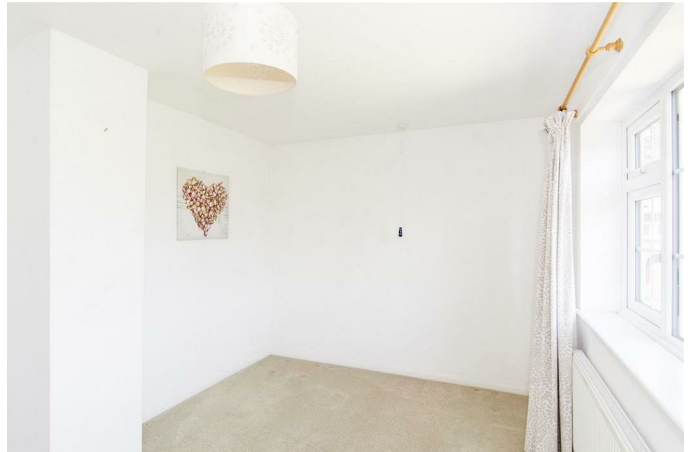
(Bedroom Two Photo Two)

Double-glazed window to the rear elevation Radiator. Fitted double wardrobe.