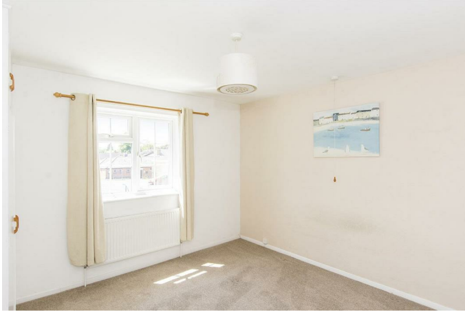
Bedroom One 11'8" x 11'8" (3.56m x 3.56m)

Double-glazed window to front elevation. Fitted wardrobe. Radiator. Telephone point. Television point.