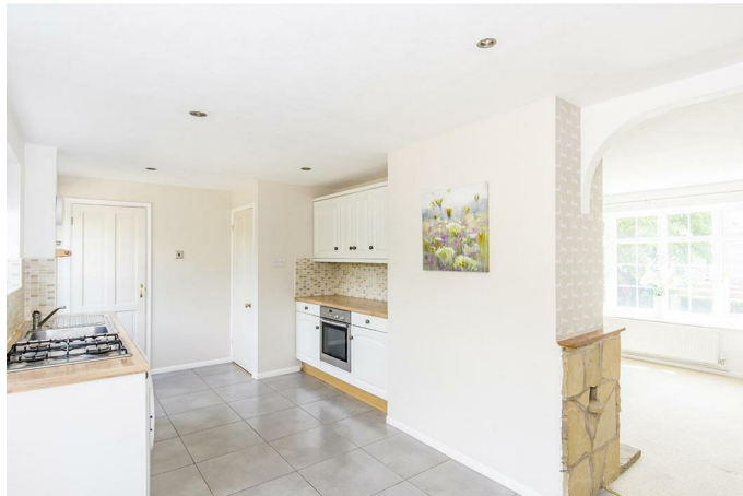
(Kitchen/Breakfast Room Photo Three)

Two double-glazed windows to rear elevation. Double-glazed door leading out to the rear garden. Fitted base and wall units. Roll edge work surfaces with complimentary tiled splash backs. Fitted oven and four ring gas hob. Stainless steel sink and drainer. Automatic washing machine. Radiator. Tiled flooring. Door to walk in larder.