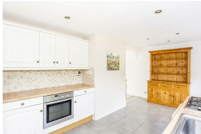
(Kitchen/Breakfast Room Photo Four)

Two double-glazed windows to rear elevation. Double-glazed door leading out to the rear garden. Fitted base and wall units. Roll edge work surfaces with complimentary tiled splash backs. Fitted oven and four ring gas hob. Stainless steel sink and drainer. Automatic washing machine. Radiator. Tiled flooring. Door to walk in larder.